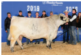
Eddie The Eagle - Sire