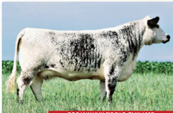
CODIAK WHY FIDDLE GNK 108D

Registration: 5289-PB Tattoo: CCCC 22C Current weight: 1550lbs Sire: Codiak Tycoon CAT GNK 12Z Dam: Codiak Fancy Face GNK 46Z Lifetime profitability to-date: 5 reg progeny + 0 embryos sold = $41,500 Purchased with a group of heifer calves, Chanel 22C quickly climbed the top of that group and then to the top of our herd. Several breeders have commented they have not seen an udder that good in the beef business. So we decided to break this cow last fall and sure enough she went out and beat the undefeated streak of the Debutante 4D cow this year – well that day anyway. Both cows need to make their debut at CWA one day soon. Chanel is bred to the hottest outcross bull in the breed – Gotcha 7G.