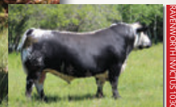
RAVENWORTH INVICTUS 103C