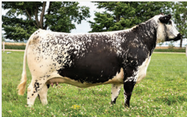
DORIS OF UNEEDA 151D

Confirmed breeding for 2022: Due January 28th to INC Night Raid 64G