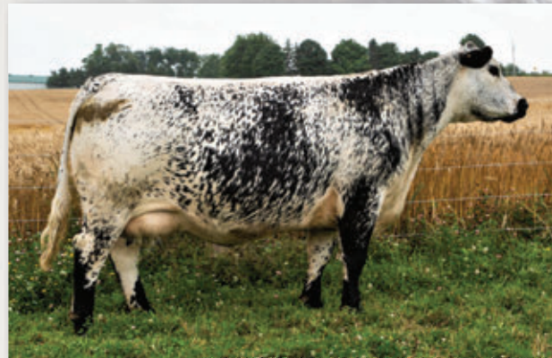
COLGAN'S CHANEL 22C

Confirmed breeding for 2022: Due January 7th to INC Night Raid 64G