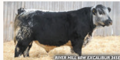
RIVER HILL 60W EXCALIBUR 345E

CODIAK OSCAR GNK 8S PRAIRIE HILL MISS 60M UNEEDA WONDERBAR 05W WYONA OF UNEEDA 51W