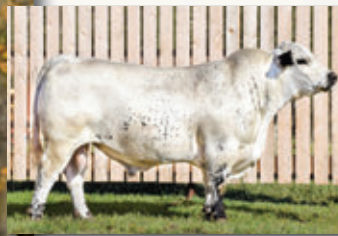
Wolf Lake Field Ready 52F - Sire