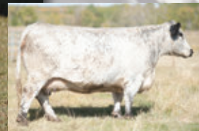
Codiak Utah 23U - Dam