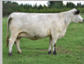
Red Maple 7881R maternal daughter of 11Z