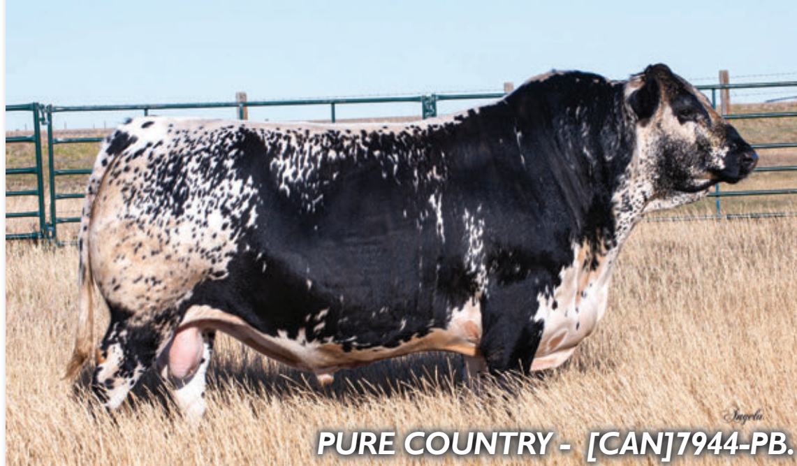
Angela PURE COUNTRY - [CAN]7944-PB.