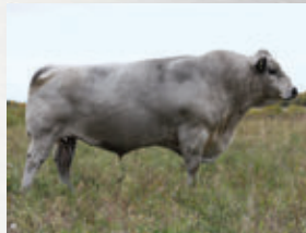
Trade Secret 11A maternal brother to 11Z

This mating combines two great genetic lines in the Speckle Park breed. JSF 11Z is a maternal sister to JSF Trade Secret 11A currently owned by Semex. His influence on the breed has been well documented in Australia, NZ, and Canada. 11Z is one of our foundation females and each year her calves have impressed us. She is thick, well balanced and feminine with a super udder and an abundance of milk. End to End 802E is a son of Oscar GNK 8S a bull who is a cornerstone to many great cow families. End to End 802E is at KFC and being used extensively in their program. These embryos include the best genetics from Codiak, JSF, Riverhill, Spots n Sprouts, and Stayls.