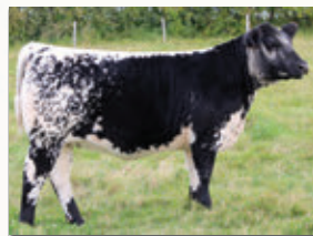
Goddess - Daughter of 70E

-70E embryos have sold for $2500/embryo, $1700/embryo, and $1650/embryo