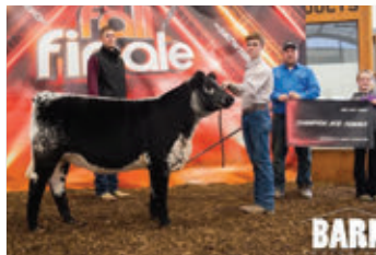
Champion AOB Female - Fall Finale