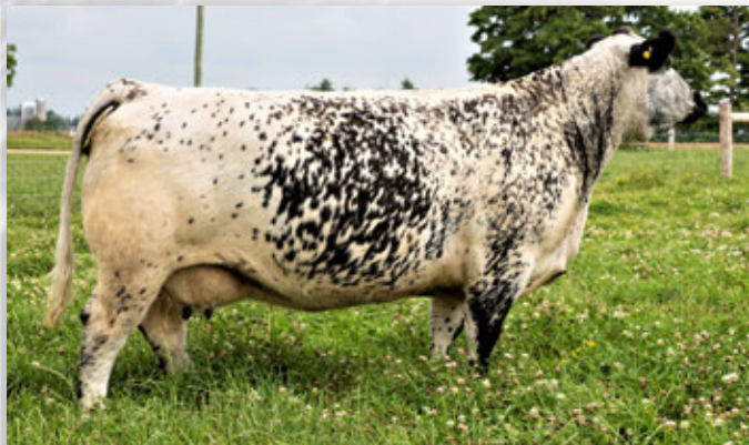
DIAMOND K RANCH DEBUTANTE 4D

LOT 101A PICK OF TOP FIVE COWS OR ENTIRE HERD