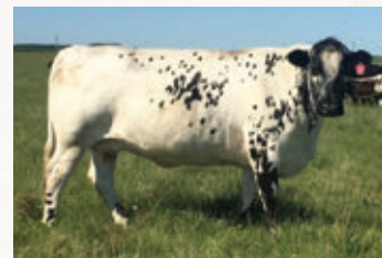
Cora Crossroads 45C - Dam