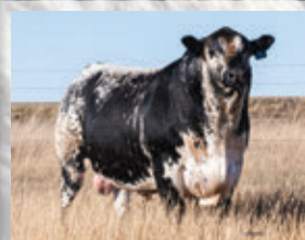
Legacy Pure Country 174E