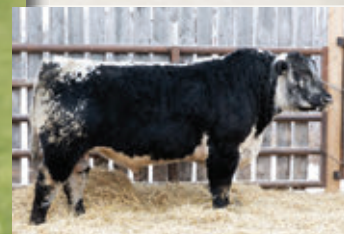
Wolf Lake Fred 43F - Sire