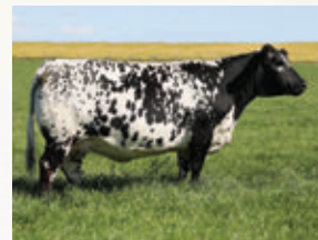
Monalisa of P.A.R. 90B - Dam