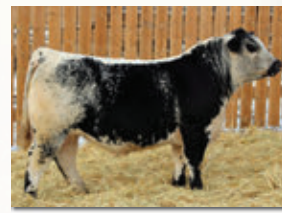
Headliner - Son of 70E