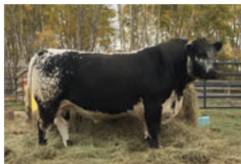
INC Dingo 26D - Sire