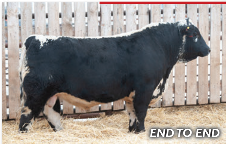
END TO END