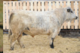
Codiak Monument GNK 107D - Sire