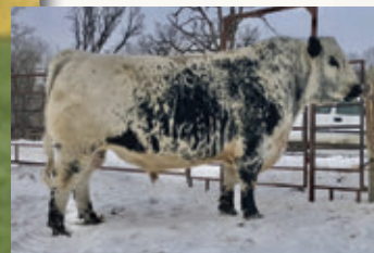
FLYING E DIGGER 4D - SIRE