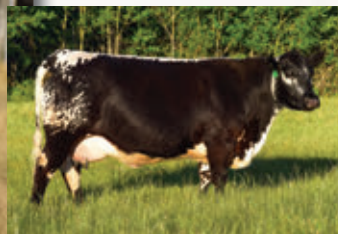
Codiak Nora GNK 75Z - Dam