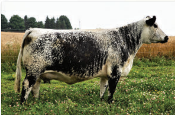
CODIAK SHZ MY SISTER GNK 69B

Confirmed breeding for 2022: Due January 5th to Splash of Black Gotcha 7G