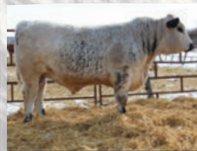
River Hill 132E Goliath 961G - Sire