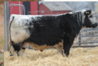
River Hill El-Beardo 354E - Sire