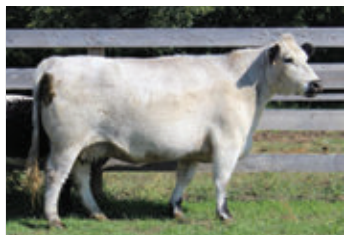
Calico Creek Day Dream 8- Dam