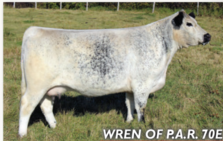
WREN OF P.A.R. 70E

UNLIMITEDSPOTS GRNWD FUTURE 20F X WREN OF P.A.R. 70E