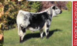
RAVENWORTH AURORA 332J